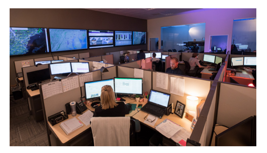
HVAC Concepts 24/7 Remote Monitoring and Alarm Management Center in Frederick, Maryland.

As an Integrator of Things<sup>™</sup>, HVAC Concepts integrates unique and diverse intelligent devices into holistic edge-to-cloud/enterprise solutions for the Internet of Things.